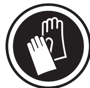
Wear Protective Gloves