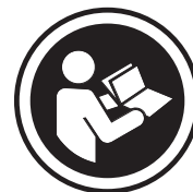
Refer to Instruction Manual/ Pack Instructions