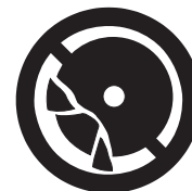
Do Not Use if Damaged