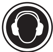
Wear Ear Protection

If you have any questions about individual products, please contact the Josco customer service team at customerservice@josco.com.au or call 1800 444 445.