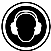
Wear Ear Protection

If you have any questions about individual products, please contact the Josco customer service team at customerservice@josco.com.au or call 1800 444 445.