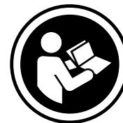
Refer to Instruction Manual/Pack Instructions