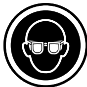
Wear Eye Protection