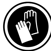
Wear Protective Gloves