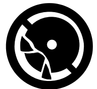
Do Not Use if Damaged